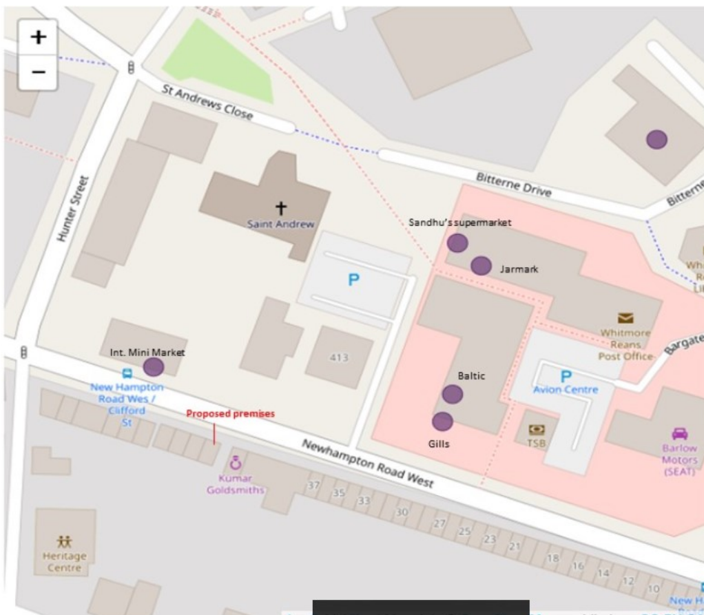
Fig 2: Outlets within Avion CIZ

3.0 Considering the application falls within the CIZ, and the applicant does not in the view of Public Health rebut the presumption of refusal, it is the view of Public Health that granting another licence within the area will exacerbate the concerning issues already identified.